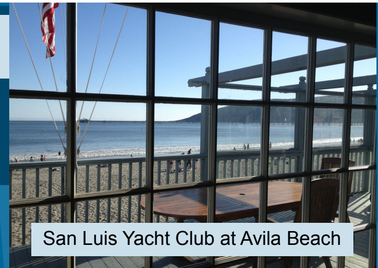
San Luis Yacht Club at Avila Beach

Teams spent countless hours preparing their Challenge Solutions. At the annual March DI State Tournament we compete against other DI kids from across California. Winning teams go on to DI Global Finals in May at University of Tennessee Knoxville, THANK-YOU